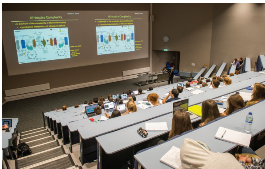
Chancellors' Conference Hall, University of Bath