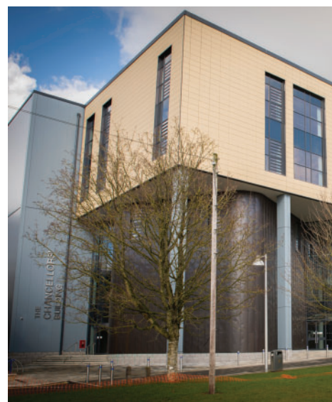
Chancellors' Building, University of Bath